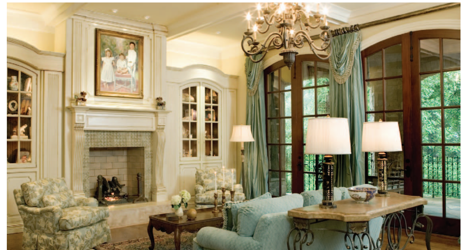
The Westminster plan reflects the Old World blend of stone and brick, and attention to detail found in Benchmark's Masterpiece Collection.